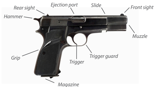
A semi-automatic pistol

A handgun is a short-barreled gun that is designed to be fired with only one hand. The most common types of handguns are semi-automatic pistols and revolvers . Most people own handguns for protection.